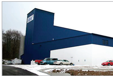
NEXT Generation's new corporate headquarters

The company has recently placed another order for an 87" (2200 mm) 3-layer VAREX® blown film to further improve its already diverse capabilities. The new line will be installed at the company's Lexington plant and will be operational by the end of the summer 2008. It will join